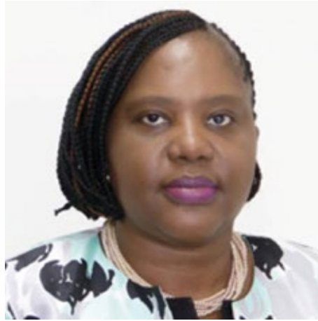
Dr Mwelecele Ntuli Malecela