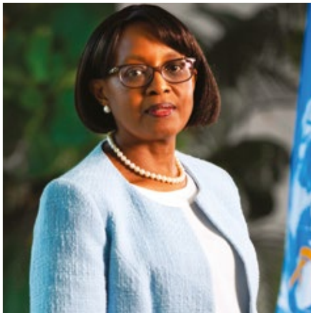
Dr Matshidiso Moeti